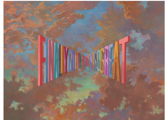
Finally Got There Wasn't So Great , 2019 Acrylic on canvas 36 x 48 inches