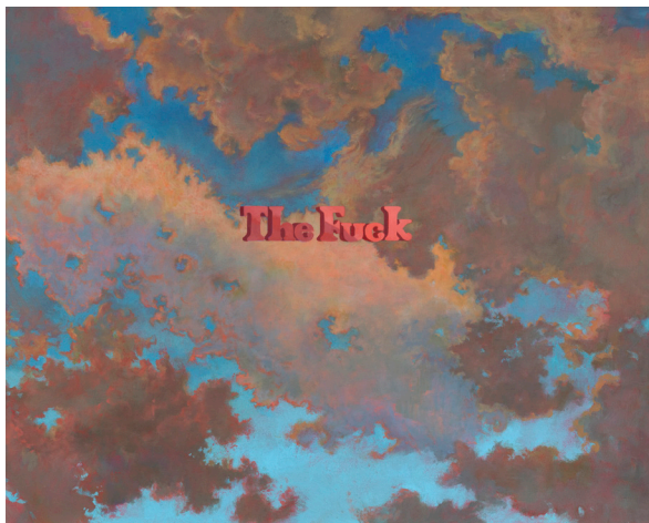
The Fuck , 2019 Acrylic on canvas 24 x 30 inches

For press inquiries, please contact Christopher Borschel at chris@joshualinergallery.com