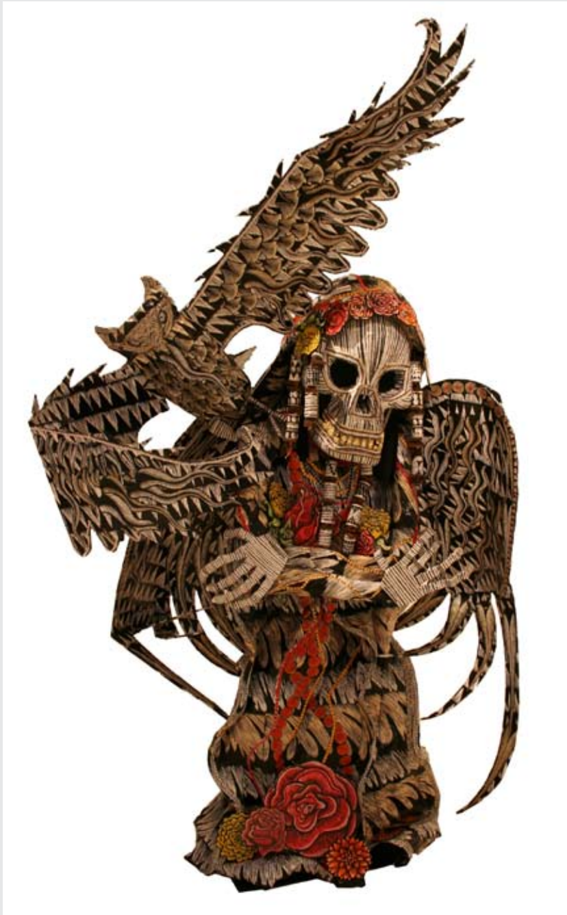
Santa Muerte Hand colored wood cut prints, paper mache and wood 120 x 72 x 48 in. 2010