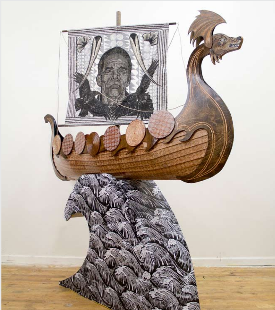
Tom Little Vessel Carved wood and woodcut prints 86 x 84 x 20 in. 2010