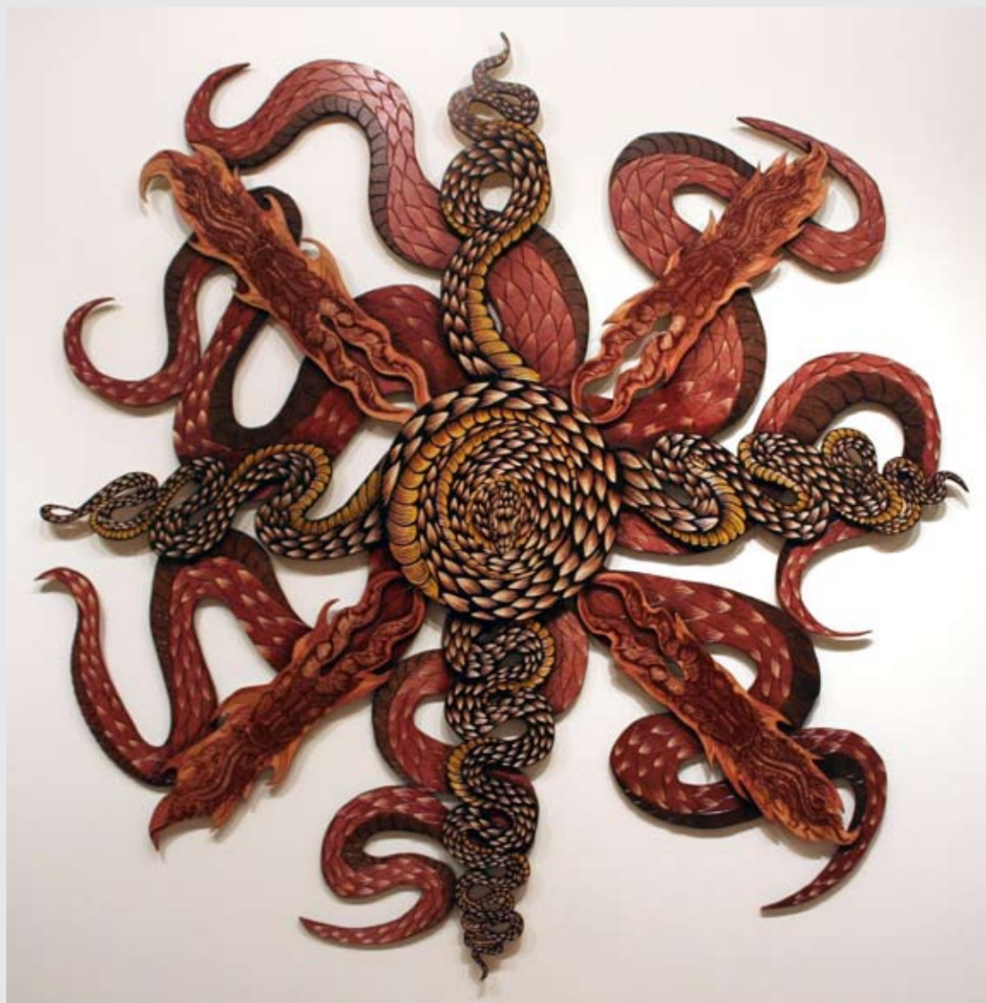
Reaping Sun Hand carved, hand painted wood 72 x 72 in. 2010