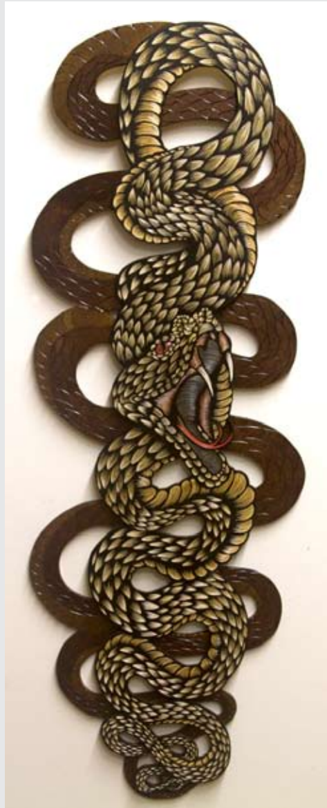
Midgard Serpent Hand carved, hand painted wood 58 x 19 in. 2010