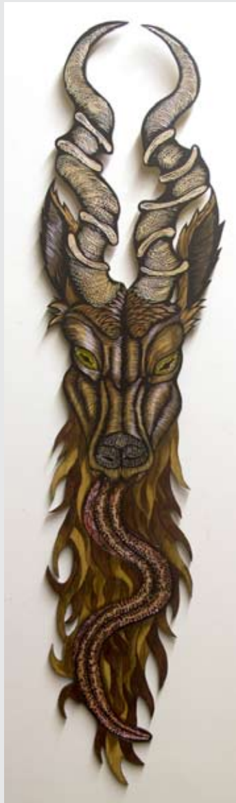
Lustful Faunus Hand carved, hand painted wood 59 x 14 in. 2010