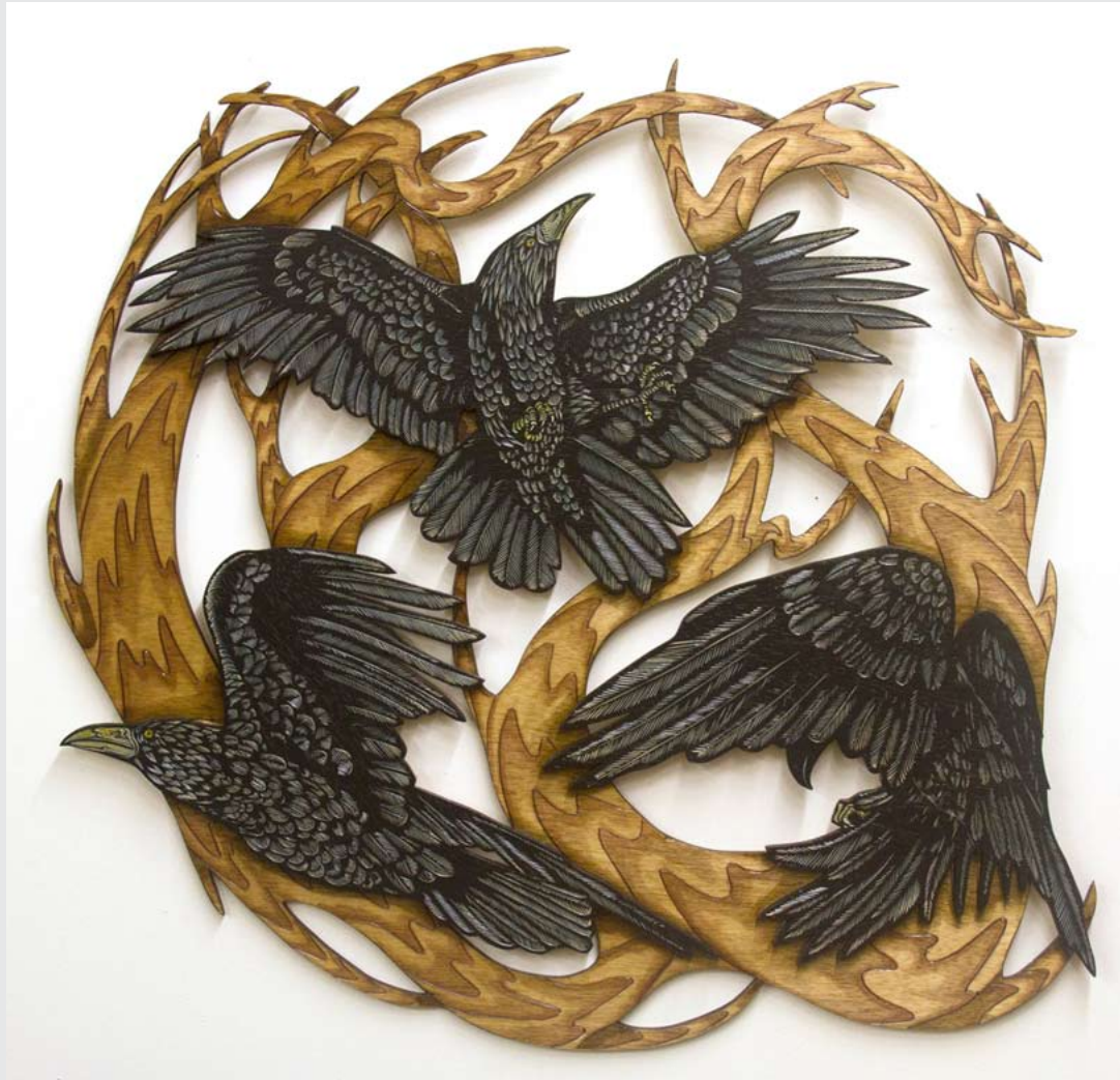
Morrigan's Murder Hand carved, hand painted wood 42 x 43 in. 2010