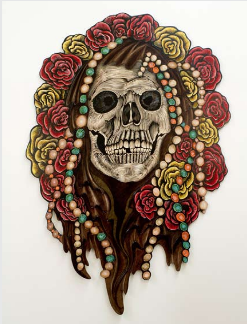
Merciful Saint of Death Hand carved, hand painted wood 56 x 39 in. 2010