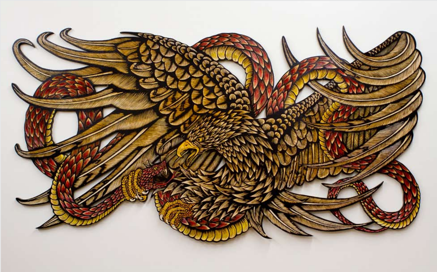
Clash of Feather and Fang Hand carved, hand painted wood 44 x 89 in. 2010