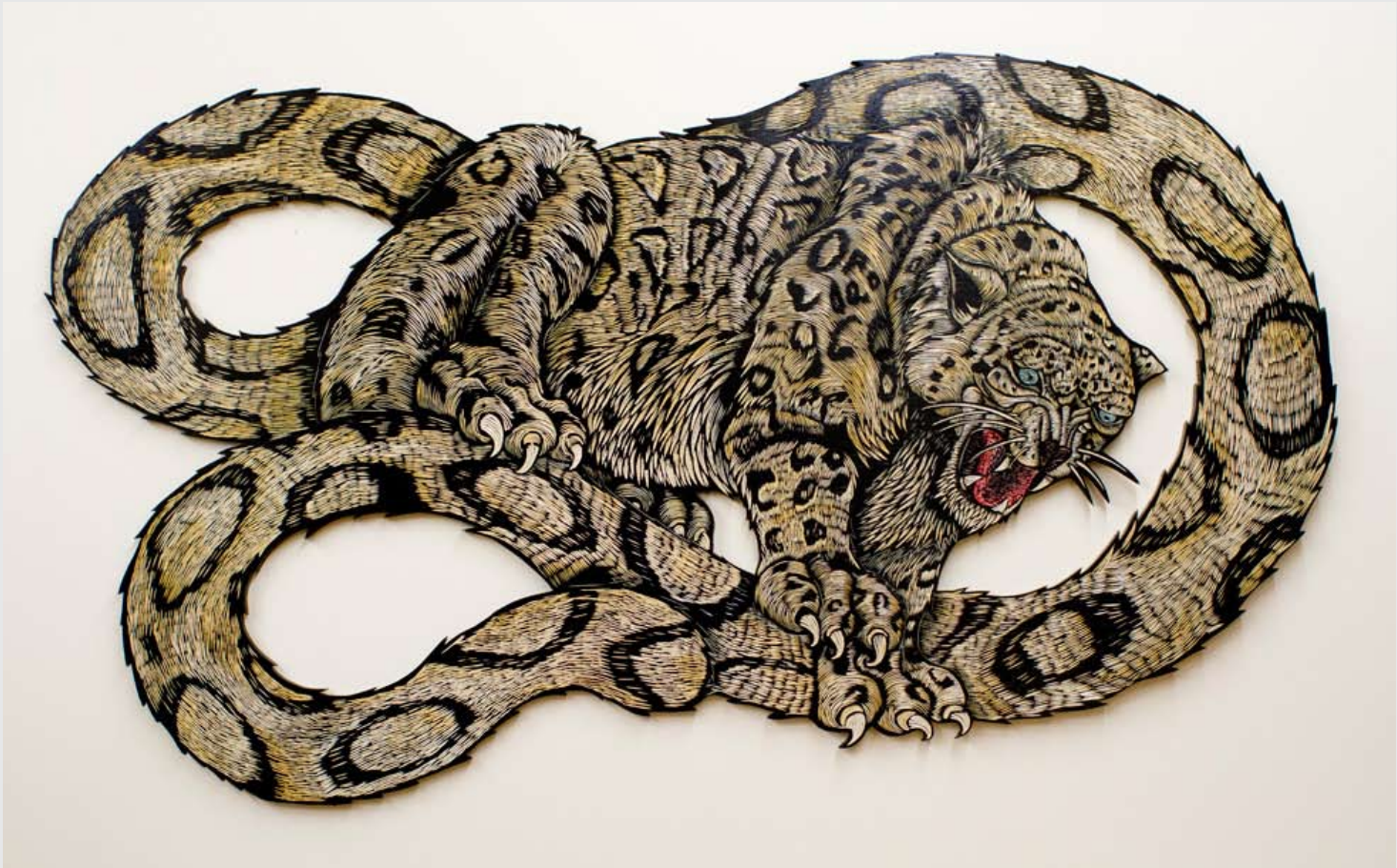
Uncia Uncia Hand carved, hand painted wood 47 x 85 in. 2010