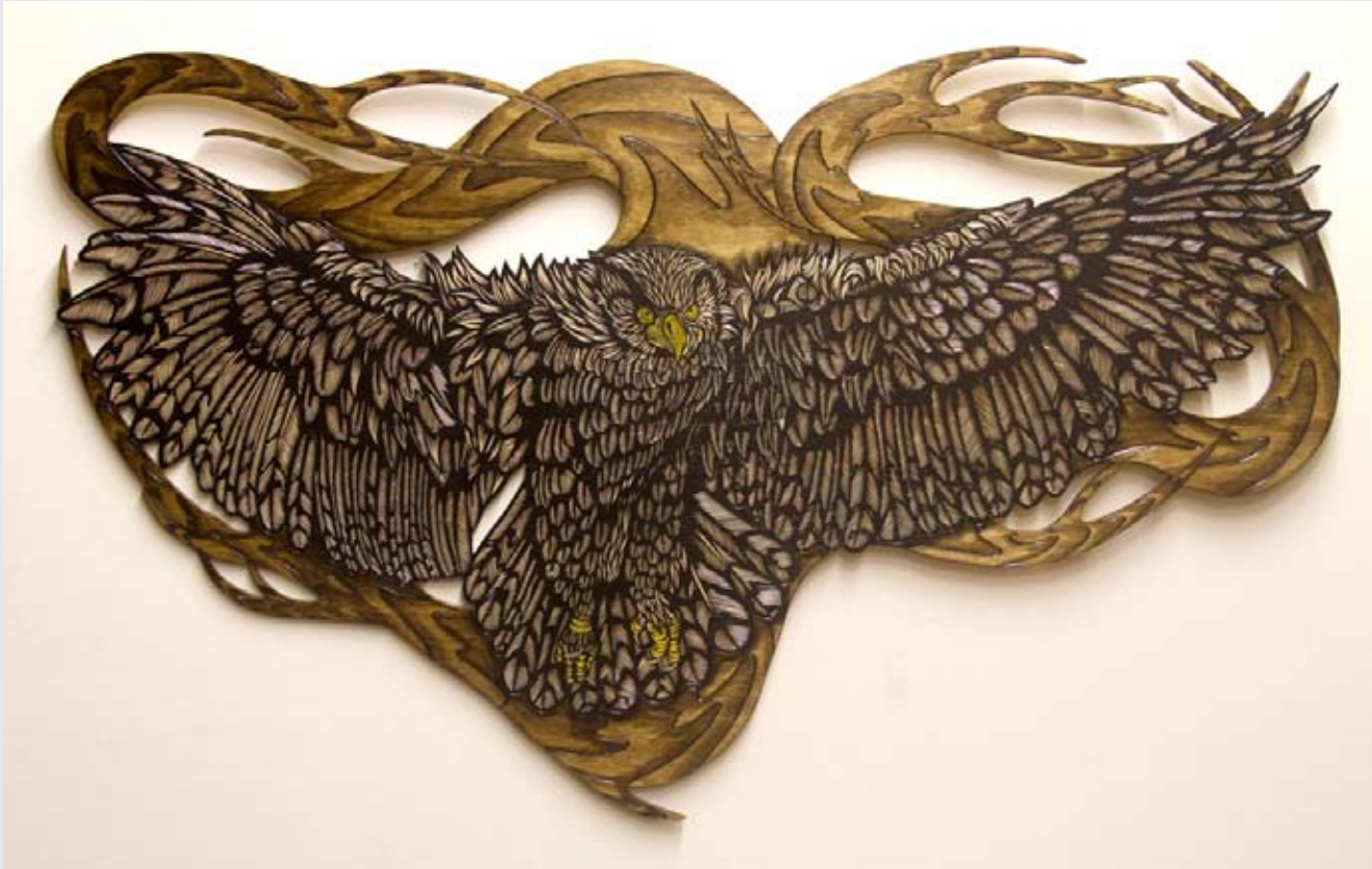
Crossing the Owl's Bridge Hand carved, hand painted wood 37 x 60 in. 2010