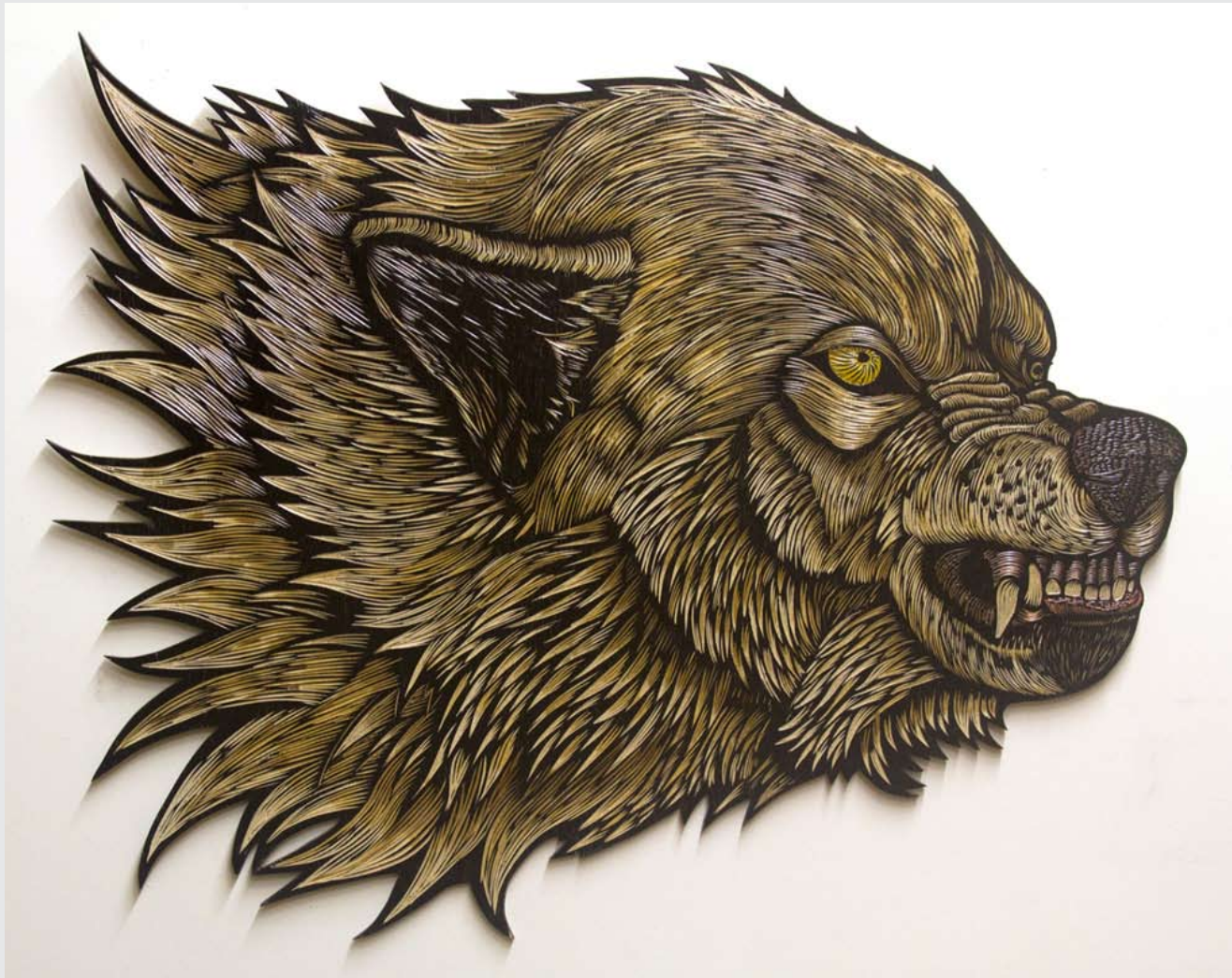
Skoll: Sun Swallower Hand carved, hand painted wood 36 x 46 in. 2010